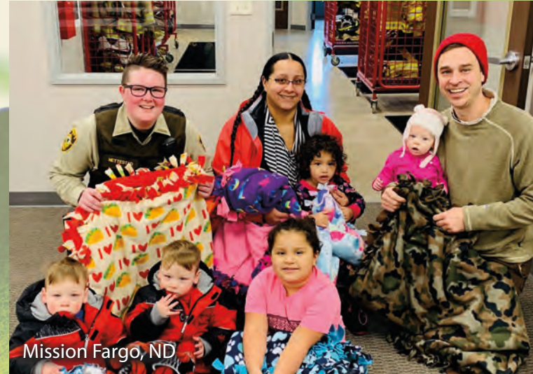
Mission Fargo, ND