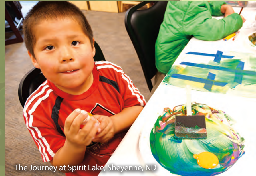
The Journey at Spirit Lake, Sheyenne, ND

Healthy churches multiply disciples, leaders, ministries, and congregations. A multiplication DNA, if set from the start, leads to church reproduction.