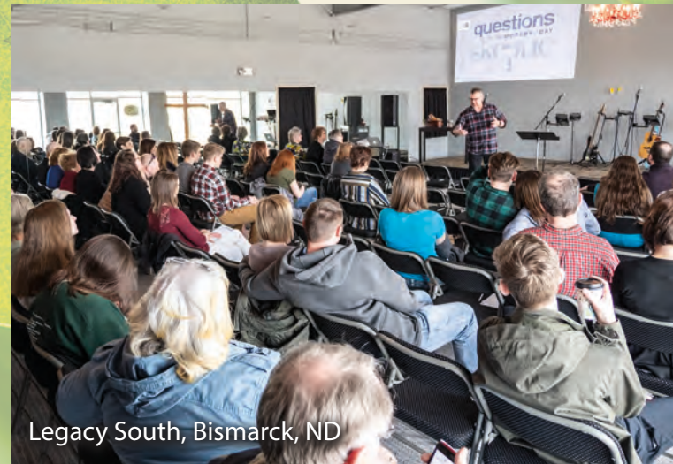
Legacy South, Bismarck, ND