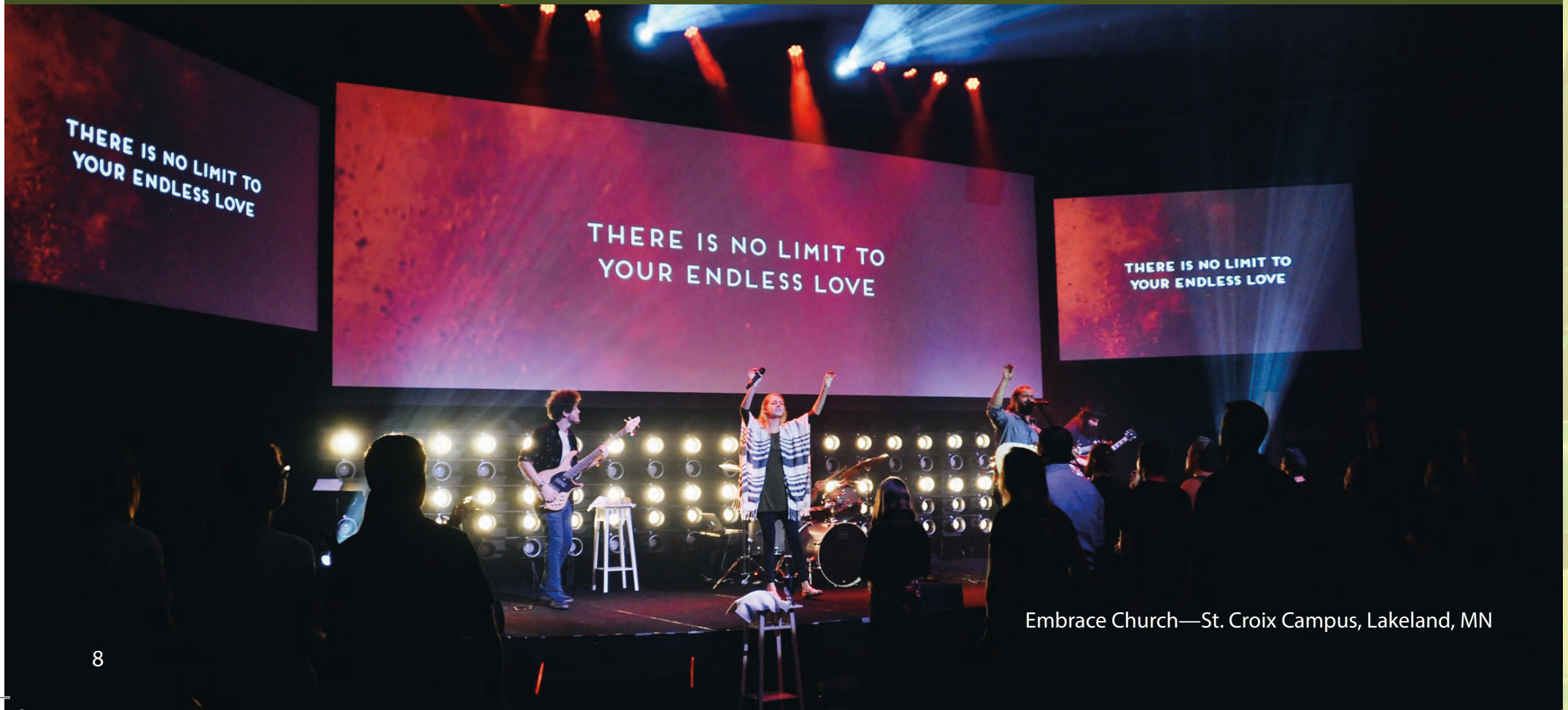
Embrace Church—St. Croix Campus, Lakeland, MN