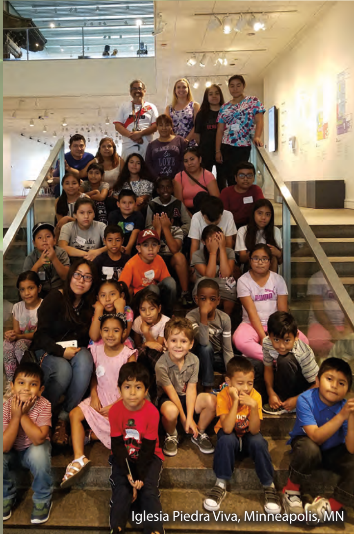
Iglesia Piedra Viva, Minneapolis, MN